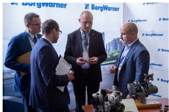
BorgWarner's booth in the display area