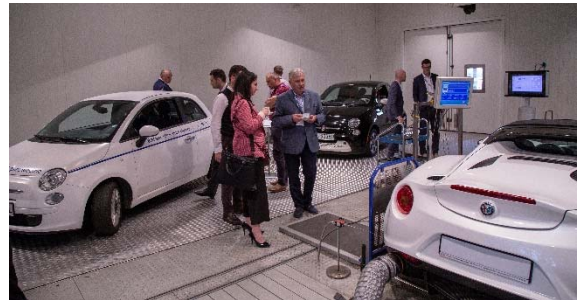
BOSMAL's exhaust emissions laboratory being presented to attendees